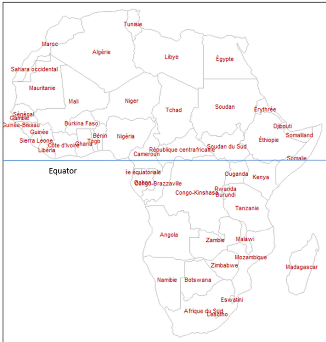
Figure 1. Map of Africa showing all countries.

Meanwhile, there have been controversies in relation to the speed of temperature increase, on the appropriate estimation method to model temperature across time. The most standard approach still recommends incorporating a linear trend in the modelling framework. Using the linear model with fractional integration methods, Gil-Alana et al. (2019) examined issues such as linear trends, seasonality and persistence in Western, Eastern, and Southern regions of Africa and found that time trends are required in most of the countries to explain the climate features in the areas. They also found evidence of structural breaks in some of the countries. Other papers that have applied fractional integration in a linear framework to analyse temperature and rainfall data include Ogunsola and Yaya (2019) and Yaya and Vo (2020).