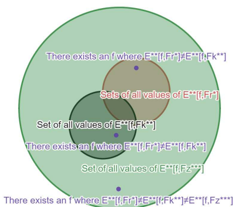
Figure 1. Below F_r^*, F_k^{**}, F_z^{***} are non-equivalent starred sequences of sets, where V' is all circles and E^{**} is the generalized expected value of f w.r.t either \star -sequence of sets (def. 8)

Definition 12 (Equivalent Starred-Sequences of Sets). All starred-sequences of sets (in the set of \star -sequences of sets) are equivalent, if we get for all f \in V' (def. 10); the generalized expected value of f (def. 9) w.r.t each starred-sequence of sets has the same value. See Figure 2.