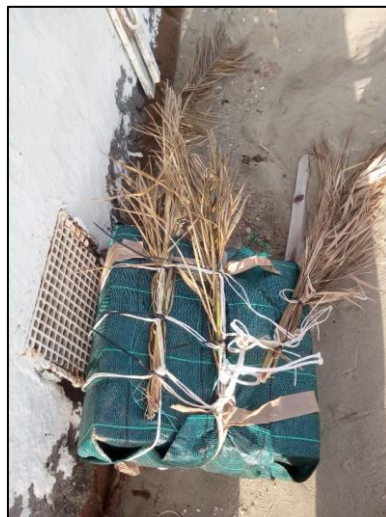
Figure 3. Parts of an illegal FAD located 9 km north the beached animal (see Fig. 1).

Few days later, just 9 km north from the stranding location (Fig. 2) a floating part of a new illegal FAD was found (Fig. 3).