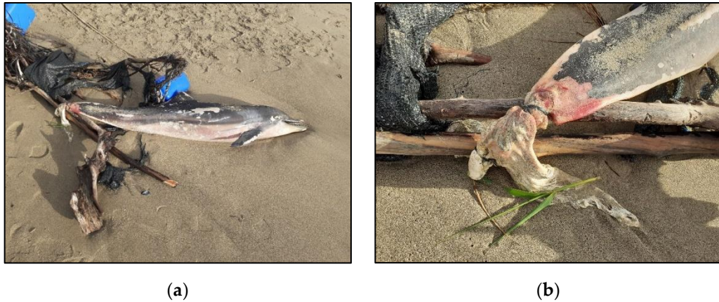
Figure 2. Photographic evidence by V. Manfrini: (a) beached striped dolphin ( Stenella coeruleoalba ) and remains of an illegal FAD (recycled plastic bottles, nylon ropes, dark green plastic sheet, with not vessel registration numbers); (b) detail on the peduncle (hematomas) and tail (necrotic tissue) of the striped dolphin with the FAD parts.

The post-mortem examination showed an empty gastrointestinal system, with no food remaining. Regarding the tail, the state of decomposition of the tissues was severe and much worse than the rest of the body. It was considered an expression that the stricture and the following necrosis occurred when the animal was still alive. No other findings emerged from the exams of the organs. PCR tests detected the presence of Herpesviruses in brain and lung tissue. Histological examination was attempted only on the lung to highlight signs of drowning/asphyxia. Unfortunately, no confirming lesions were found due to the poor state of conservation.