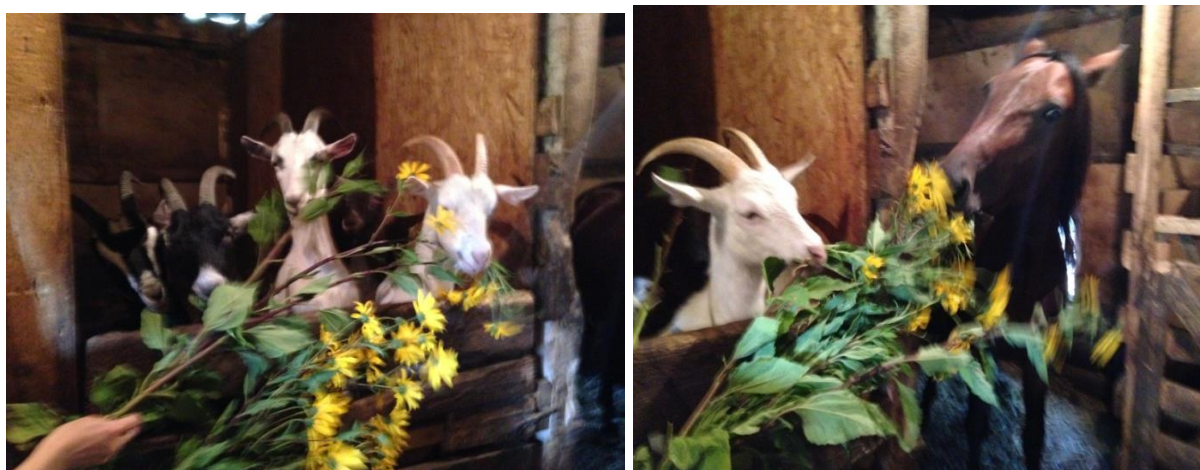
Figure 2. Artichoke green mass is kickshaws (the farm household headed by E.I. Stroeva, an individual entrepreneur (village Serebrovo, Kameshkovskiy district, Vladimir region).

Animals have been noted to consume readily both Jerusalem artichoke green mass and root crops (Figure 2).