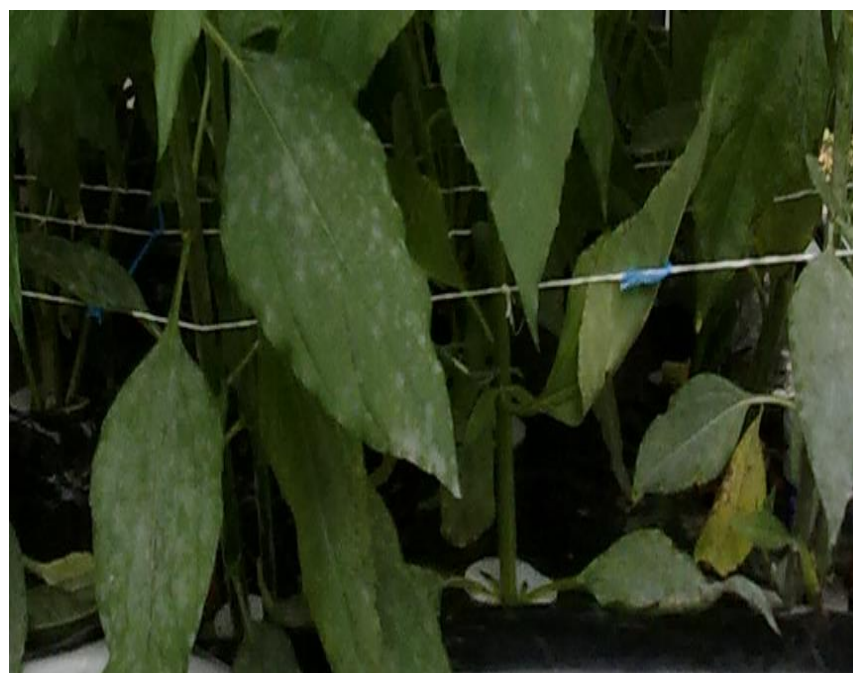
Figure 4. Jerusalem potato affected by powdery mildew.