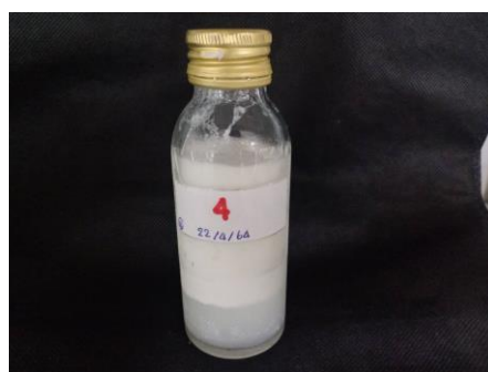
Figure 8. Preserved NR for 60 days.