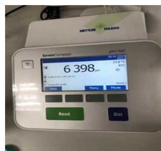
Figure 2. pH of NR.