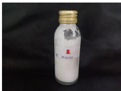
Figure 6. Preserved NR for 30 days (arrow).