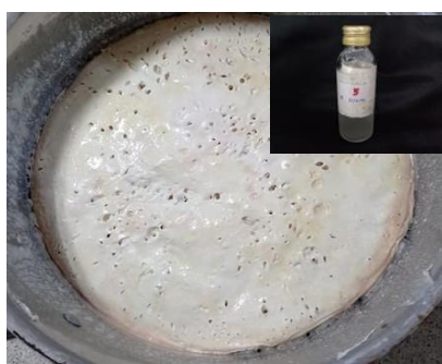
Figure 4. Spoiled NR.