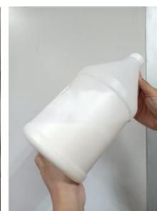
Figure 3. Viscosity of NR.