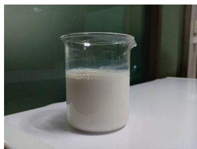
Figure 1. NR (Before preserved).

Fig. 1 illustrates that the natural rubber tapping from the rubber tree has a milky white color and pH value approximately 6.398 (Fig. 2). The behavior of fluids was a non-Newtonian formed by dispersed rubber particles of different sizes. It is a colloidal state in the solvent (Fig. 3). The flow behavior of the non-homogeneous substance and the fluid undergoes shear stress which it can flow well. The research aimed to preserve the condition of NR from spoilage by developing and improving the process of preservation with a non-ammonia solution which causes bad odor and air pollution to the environment is alternative by nontoxic substances to humans and the environment. While most previous research, it was found that if ammonia content was lower than 0.05% by weight, bacteria growth rate was higher since latex has a pH increased from 6.398 to 8, making it suitable for the growth of bacteria. Therefore, general research requires a higher than 0.1% ammonia content [17].