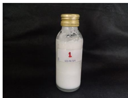
Figure 5. Preserved NR for 15 days.