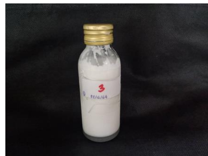
Figure 7. Preserved NR for 45 days.