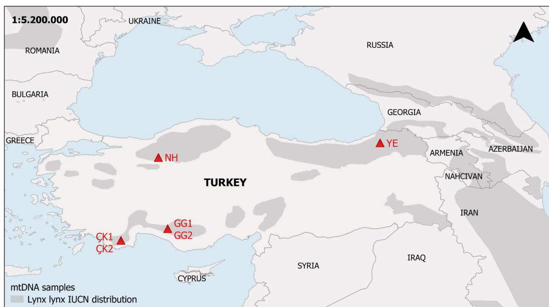
Figure 1 Map of Turkey depicting the locations of the four sampling sites for L. l. dinniki in Turkey. These sites are the Çıglıkara Forest Reserve (ÇK) and the Gidengelmaz Mountains (GG) in Southwest Anatolia, the Nallıhan Mountains (NH) in Northwest Anatolia, and the Yusufeli-Kaçkar Mountains (YE) in the Lesser Caucasus. Shaded areas indicate the distribution of Lynx lynx [5].