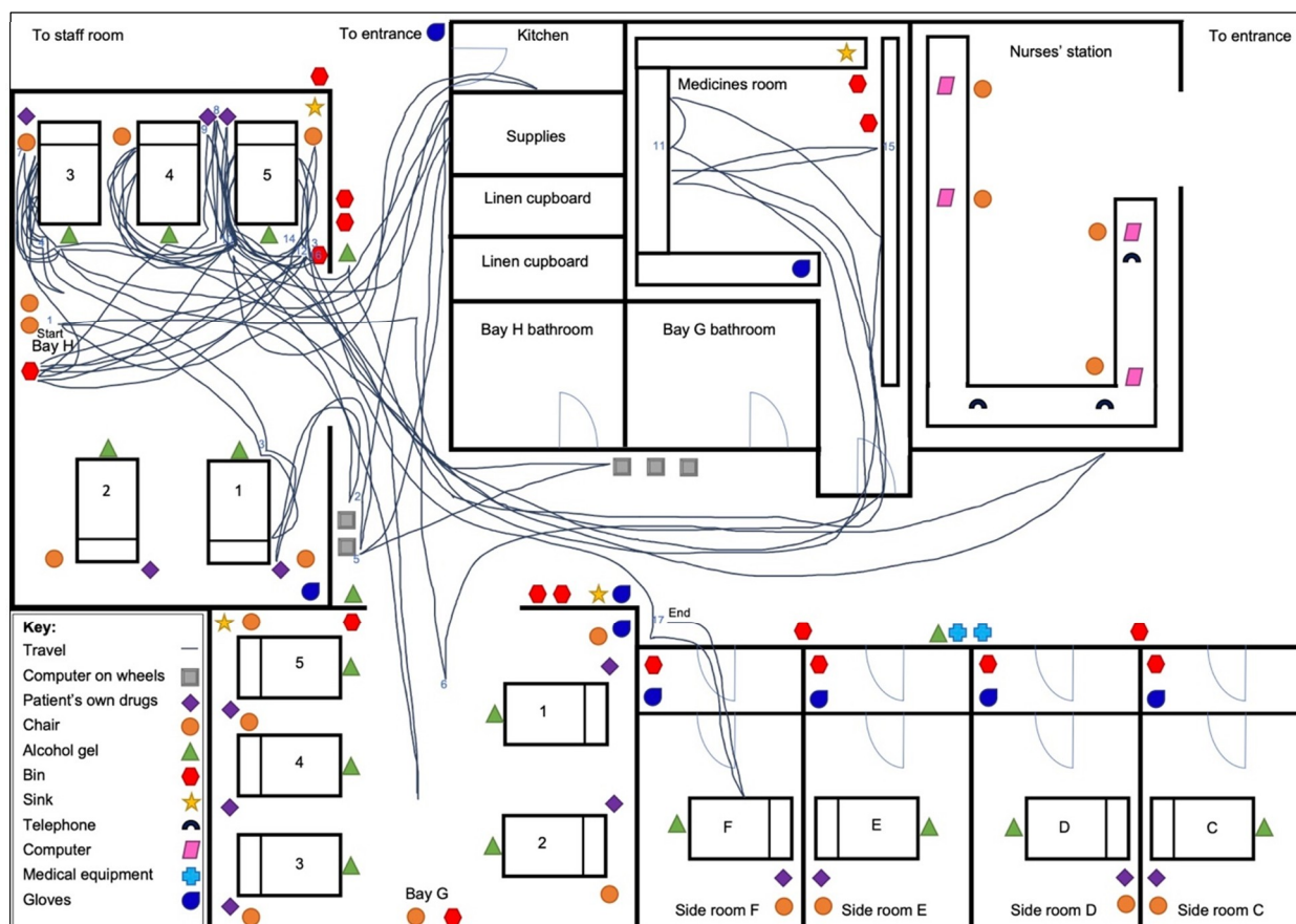
Figure 3. Spaghetti diagram on BCMA ward showing nurse walking pattern around the ward. Date: 06/12/2019; Nurse number: 12; Drug round duration: 82 minutes; Number of patients: 5; Number of doses administered: 26, BCMA= Barcode medication administration

On the BCMA ward, the majority (255 of 294; 87%), of doses administered had a scannable barcode. Those without a scannable barcode included patients' own drugs that had been repackaged in non-original packs, and insulin pens stored individually without their box. Although all other medication had scannable barcodes, some products such as nutritional supplements and vitamins could not be identified by the BCMA system, necessitating manual signing for administration. Of the 294 doses administered, 243 (83%) were scanned prior to administration. This represented 95% of scannable doses, with only 12 potentially scannable doses not being scanned. Of these 12 doses, 11 were subcutaneous enoxaparin doses prepared in the medicines room. While the boxes could have been scanned, four of the five nurses who administered enoxaparin chose to leave the box in the medicines room.