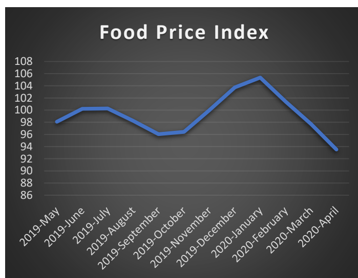
Figure 2: Monthly changes to Food Price index, International Monetary Fund [60]

Precious metals such as gold and silver however have increased in value as shown in Figure 3 , as prices of other commodities decrease due to the shock of the